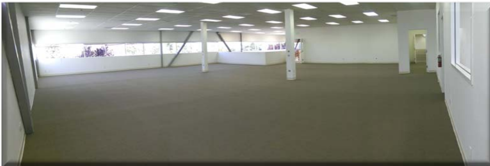
North East Open Office