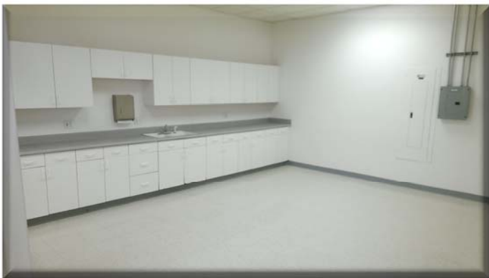
Kitchen / Break Room