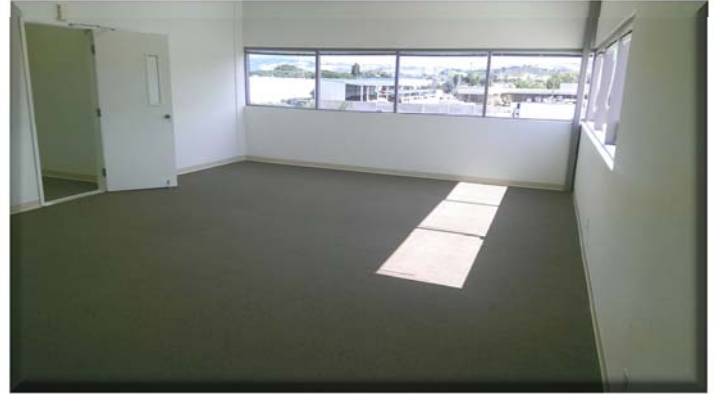
Large Corner Office 1 / Boardroom