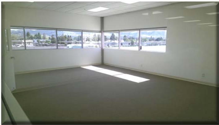
Large Corner Office 1 / Boardroom