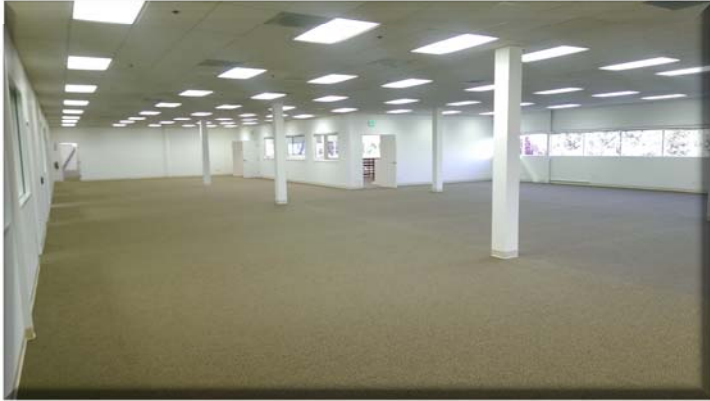
North West Open Office

5020 BRANDIN 2nd Floor FREMONT, CALIFORNIA