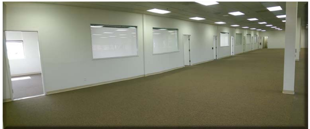
North East Private Offices