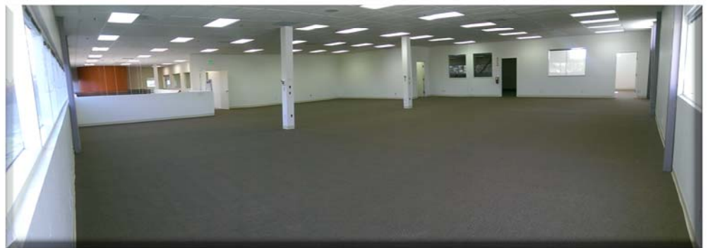
South West Open Office View 2