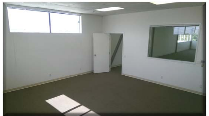
Large Corner Office 2