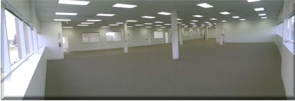
South West Open Office

5020 BRANDIN 2nd Floor FREMONT, CALIFORNIA